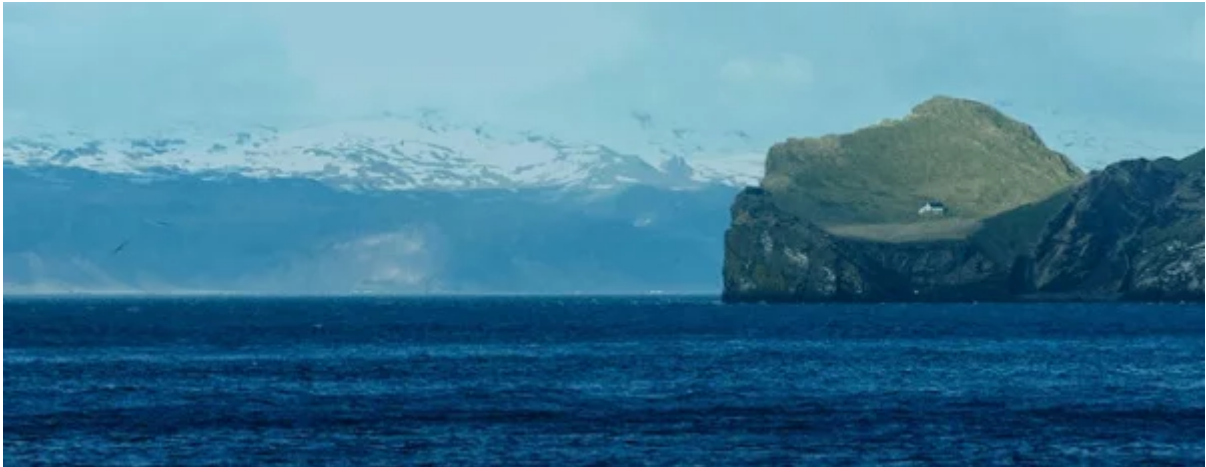
Vestmannaeyjar, Iceland.