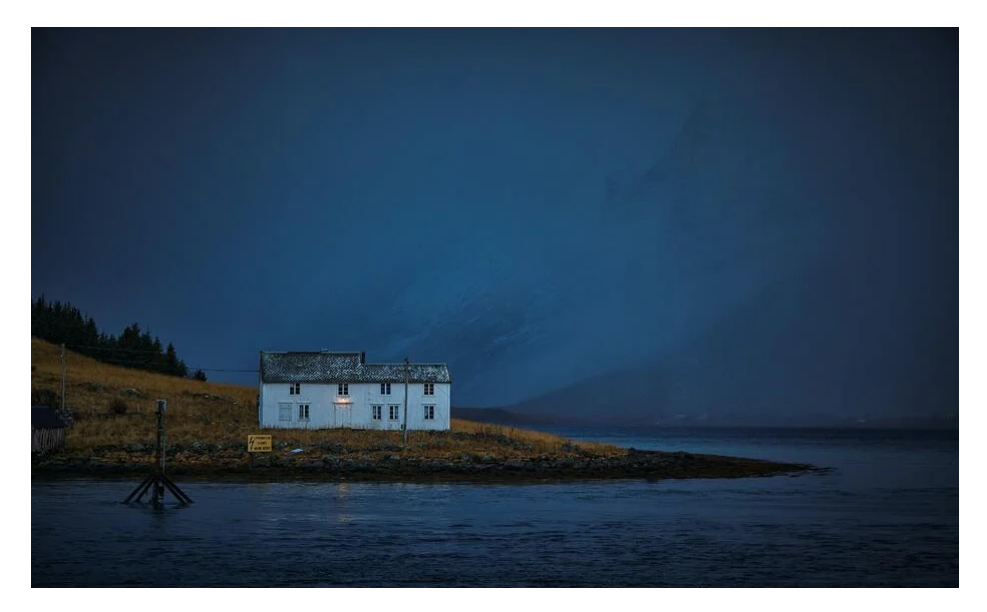
Lofoten, Norway.

Here are our updates for November. Our release webinar for Q4 2021 will be announced in the next release. Have a great weekend!