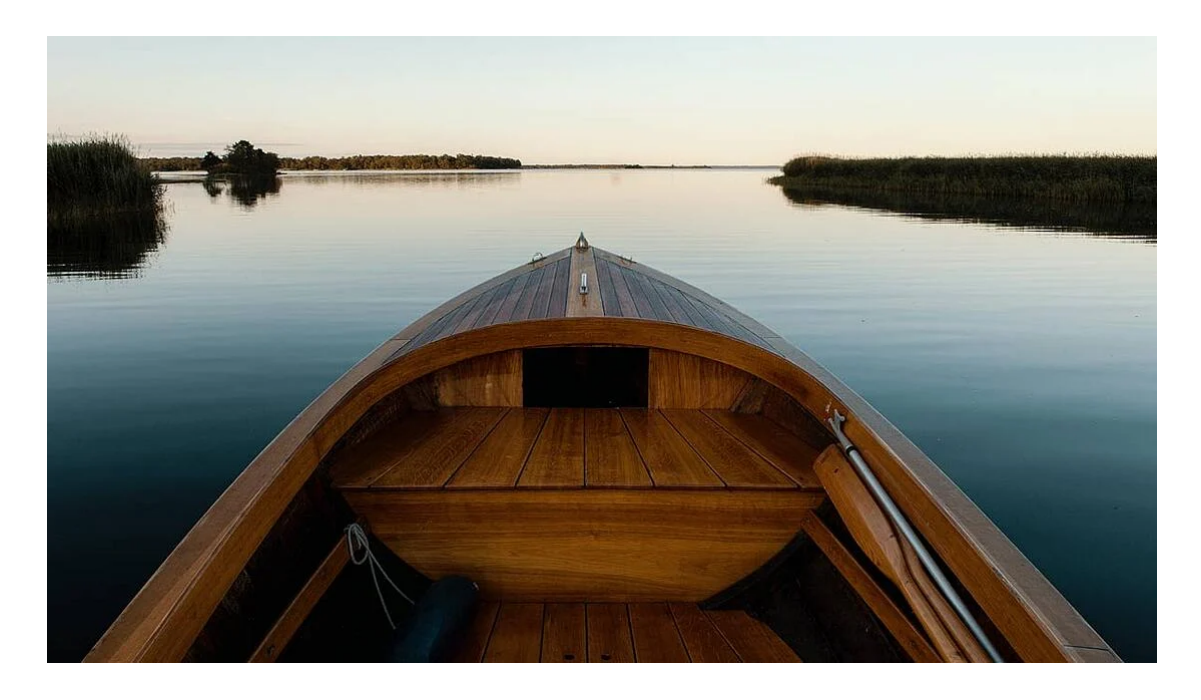
Dunö, Sweden.