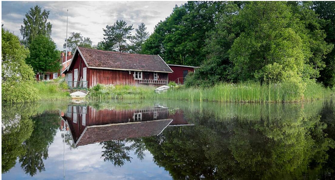
Gällaryd, Värnamo Ö, Sweden.