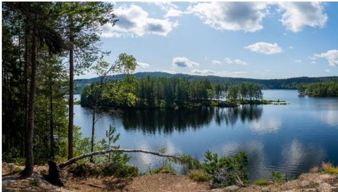
Nordmarka, Norway.