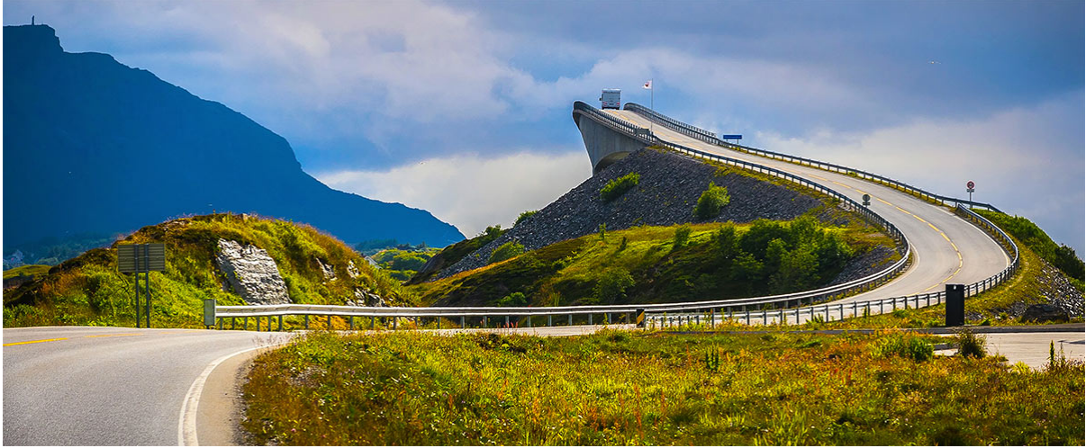
Averøy, Norway.