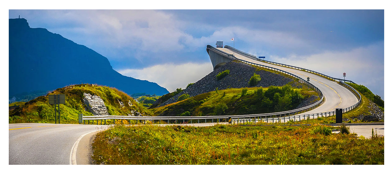
Averøy, Norway.