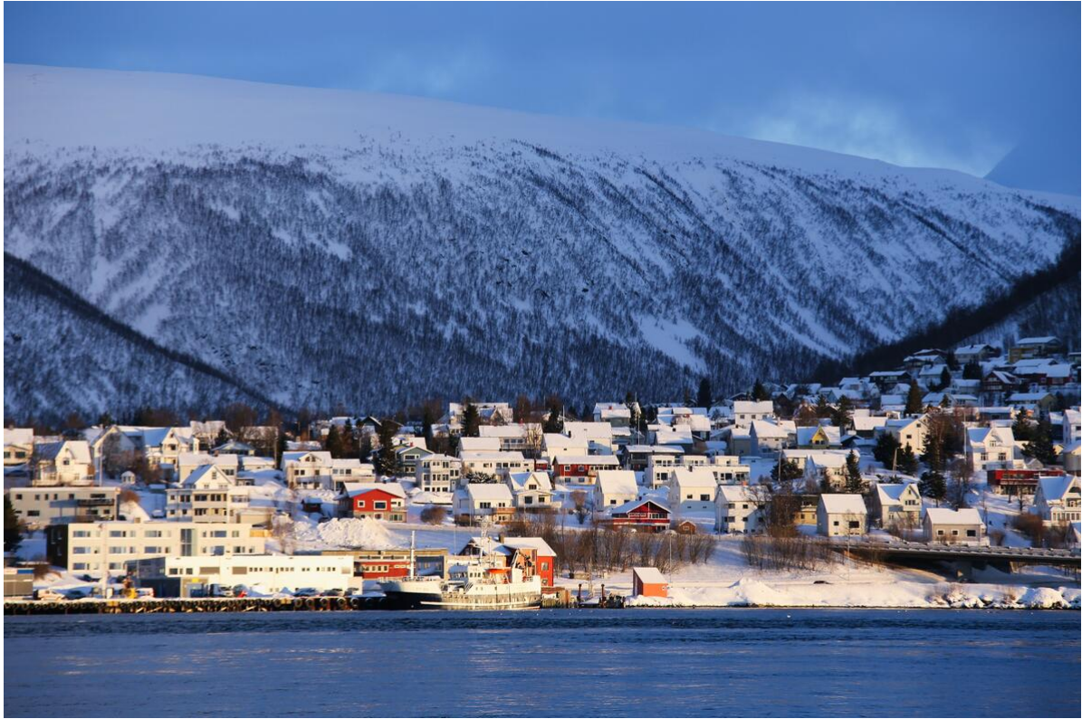
Tromsø, Norway.