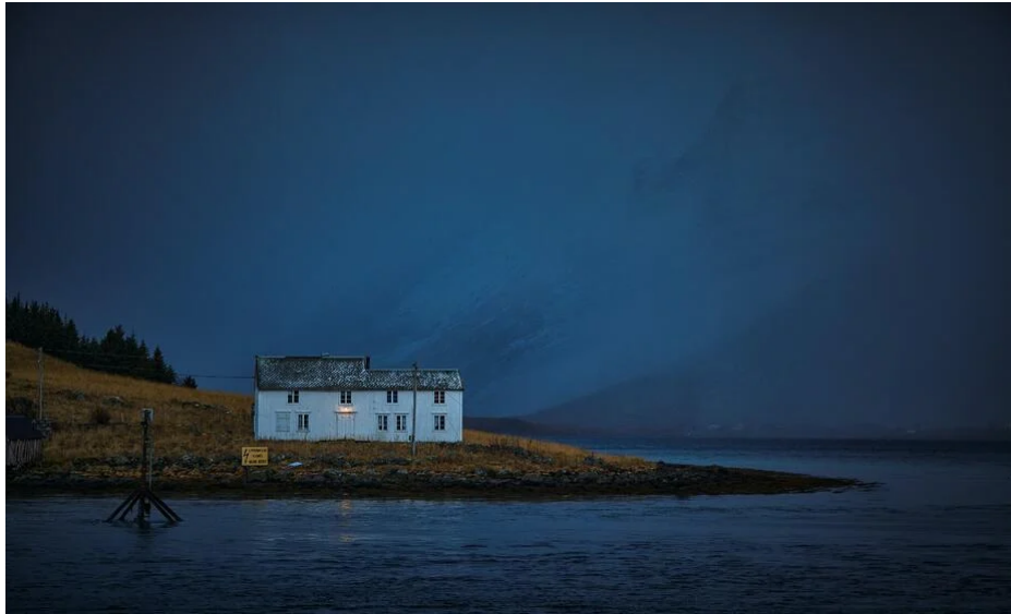
Lofoten, Norway.

Here are our updates for November. Our release webinar for Q4 2021 will be announced in the next release. Have a great weekend!