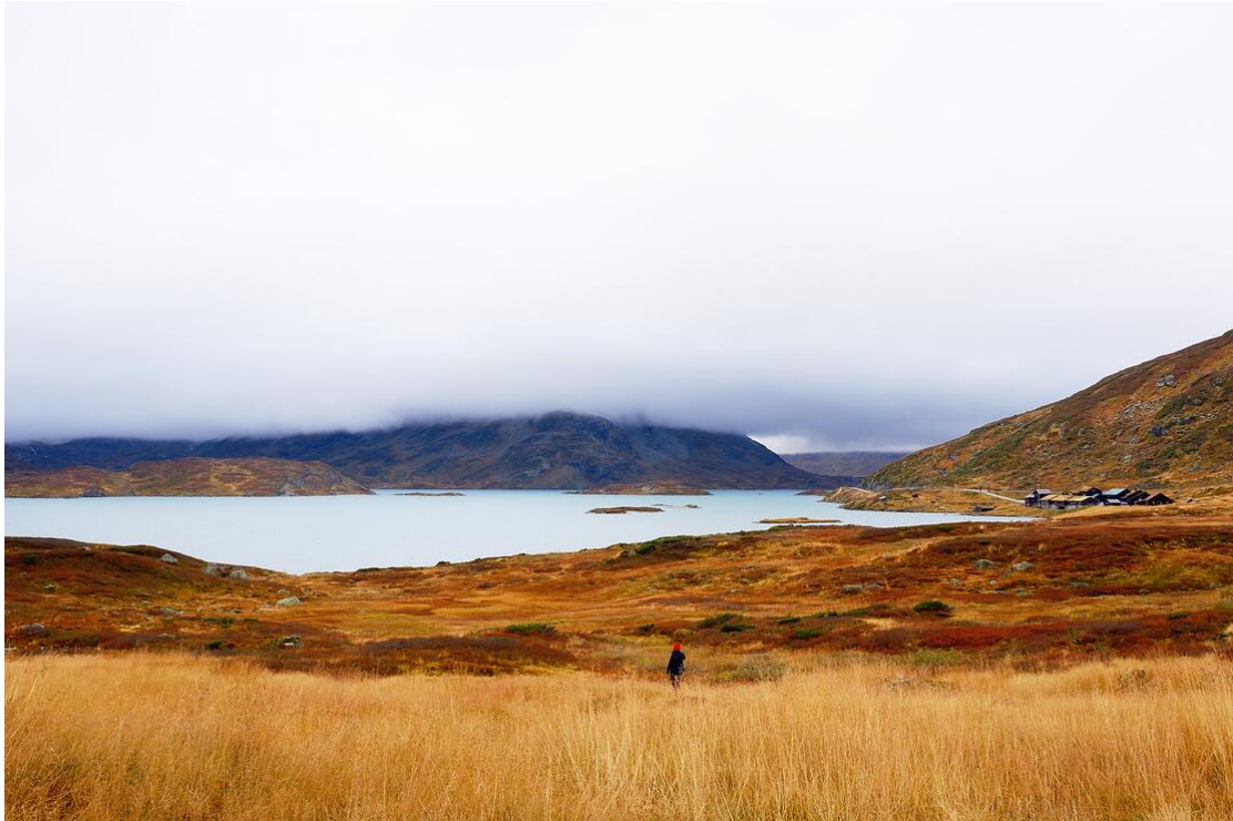
Haukeliseter, Norway.

Here are our updates for October. Our release webinar for Q4 2021 will be announced in the next release. Have a great weekend!