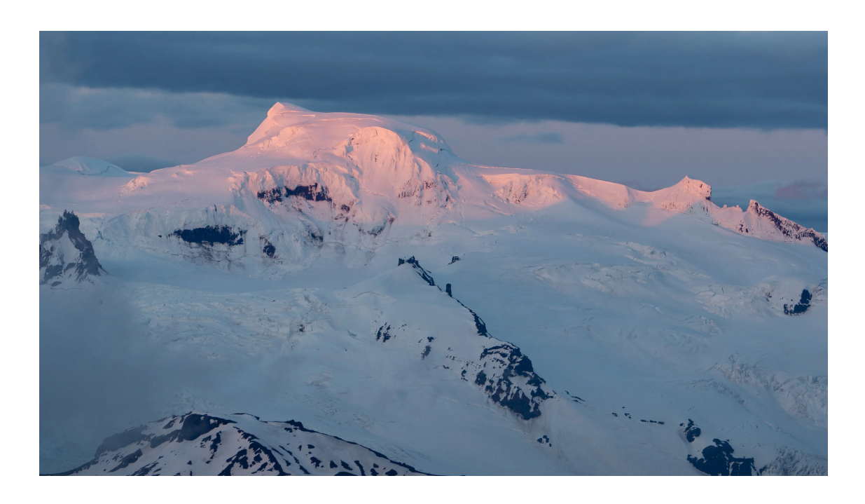
Hvannadalshnjúkur, Iceland.