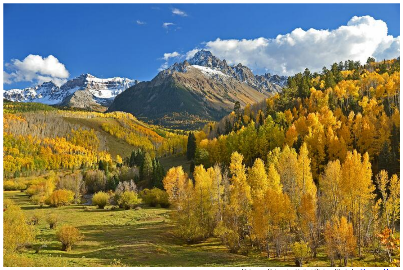
Ridgway, Colorado, United States.