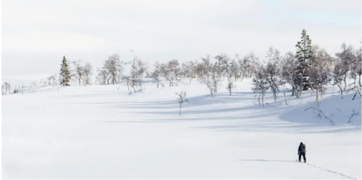
Gäddede, Sweden.

Not rendering correctly? View this email as a web page here.