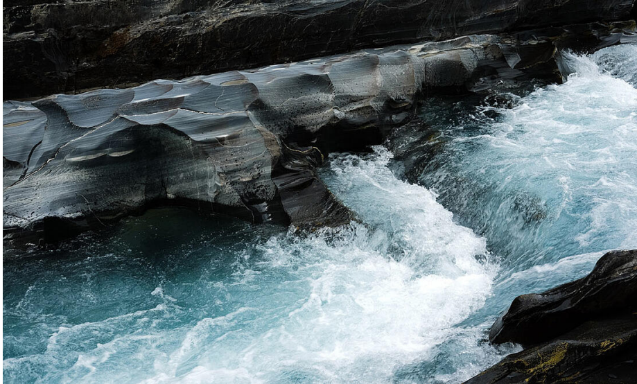
Numa Falls, Canada .